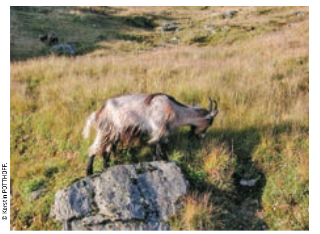
Transhumance goats in Western Norway.