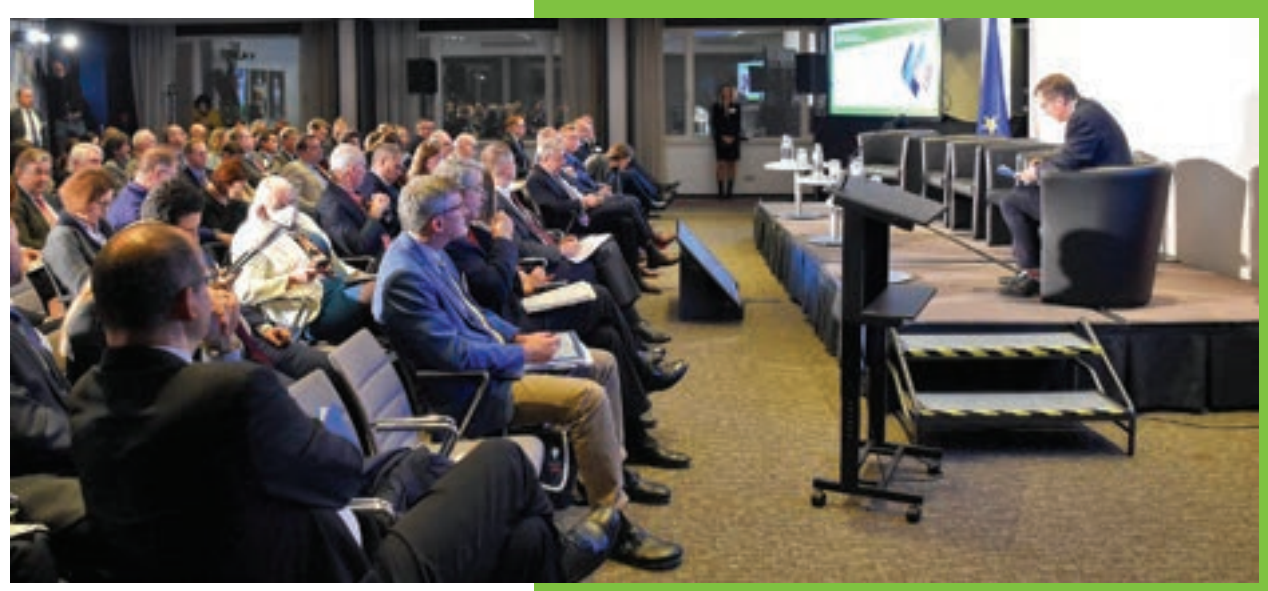
Participants to the event on the transatlantic partnership

The ELO urgently calls on all actors in this debate (rural stakeholders, NGOs and public authorities) to develop solutions together considering a positive balance between private interest and common good. This will enable all to take ownership of the objectives and generate the results that need to be achieved.