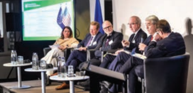
Session 1 participants