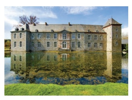
The study aims at assessing the added value of family-owned heritage houses in Europe; as well as identifying innovative business models.

One of the main added values of this project was identified by participants of its first workshop on November 6, 2018: it is the first ever Study which aims to have a European overview and to address the challenges of heritage houses at the European level. It aims at having an encompassing vision.