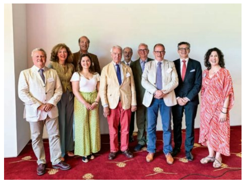
Speakers of the Generational Handover Workshop

After a walking tour of the pittoresque capital, Ponta Delgada, the group was treated to a sea adventure of rainbows, sunshine, downpours and fortunately both the charming Bottlenose and Risso Dolphins playfully swimming by. Moving to the middle of the island, the group discovered the island's volcanic activities with breathtaking crater lakes and hot springs.