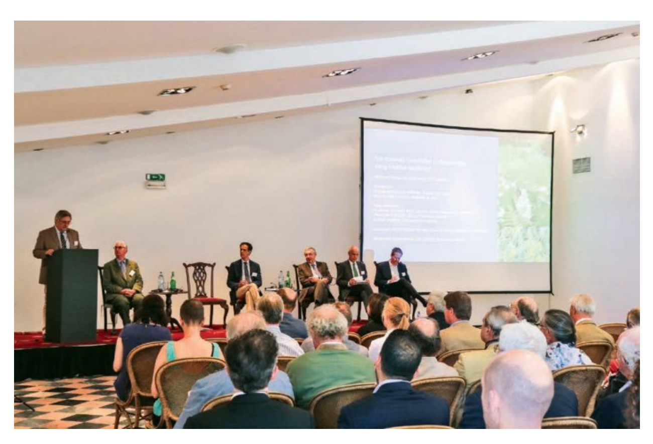
Friends of the Countryside 25th Jubilee General Assembly: