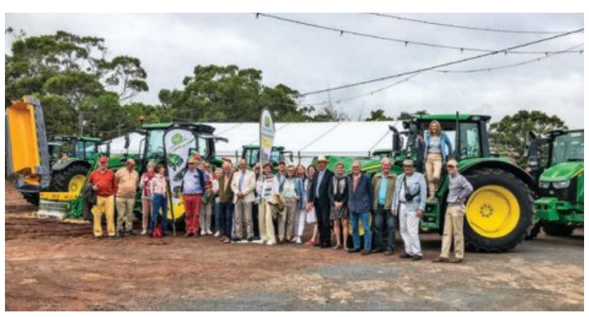
Participants of the FCS Portugal Post-tour

The slightly isolated Azores have a very unique economy, environment and life and are sure to experience an exciting transformation with the current challenges of climate change and increasingly fast-paced tourism.