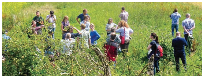
PARTRIDGE project partners discussing project habitat measures at one of the German demonstration sites.

After only one year, PARTRIDGE has achieved considerable early successes, in particular an exceptional uptake of high-quality habitat measures on almost all ten demonstration sites. This has resulted in the creation of habitat improvements that already exceed 7% of the farmed areas at most sites, which significantly exceed levels typical of current