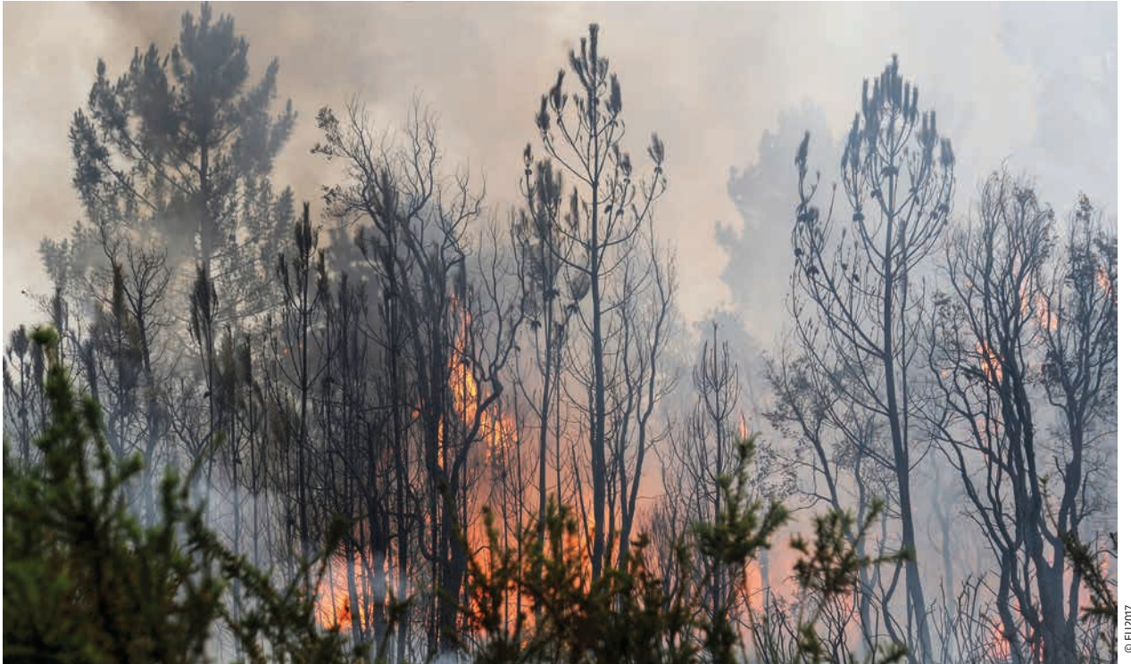
Forest fires in the South of Europe in 2017