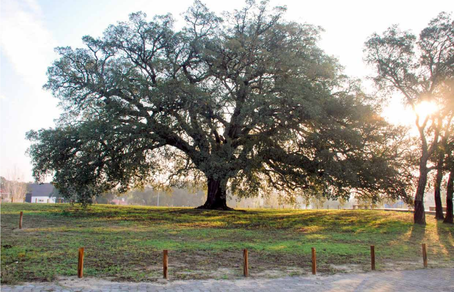
Portuguese candidate for the European Tree of the Year, the 'Largest Cork Oak in the world'