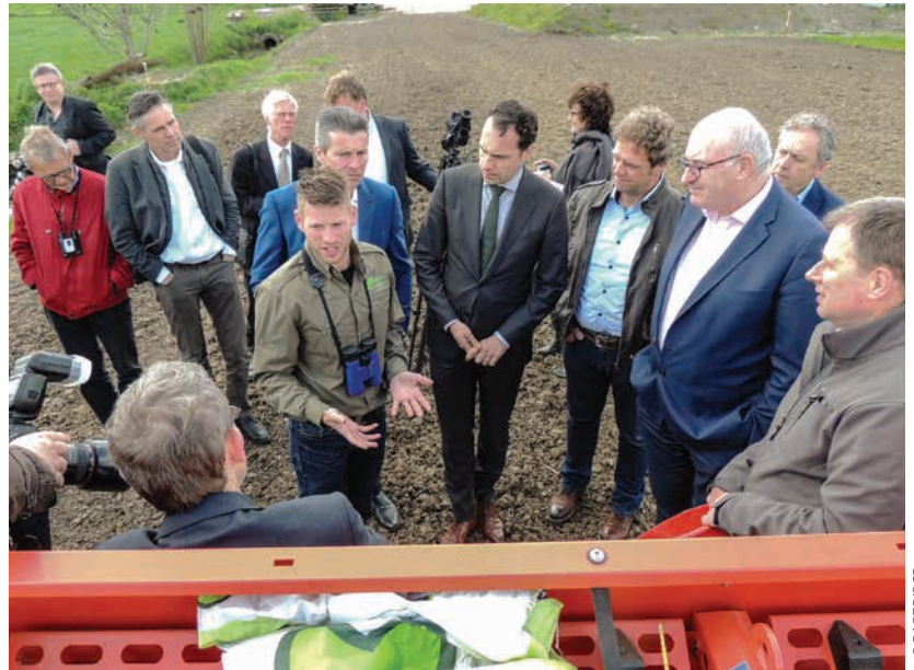
Phil HOGAN, European Commissioner for Agriculture and Rural Development, and Martijn van DAM, Dutch Secretary for Economic Affairs, visiting the Oude Doorn site, Netherlands, 2017.

The grey partridge is one of the best indicators of farmland ecosystem health; where partridges thrive, biodiversity is high and ecosystem services remain in-