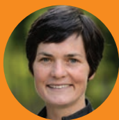
Dame Ellen MacArthur