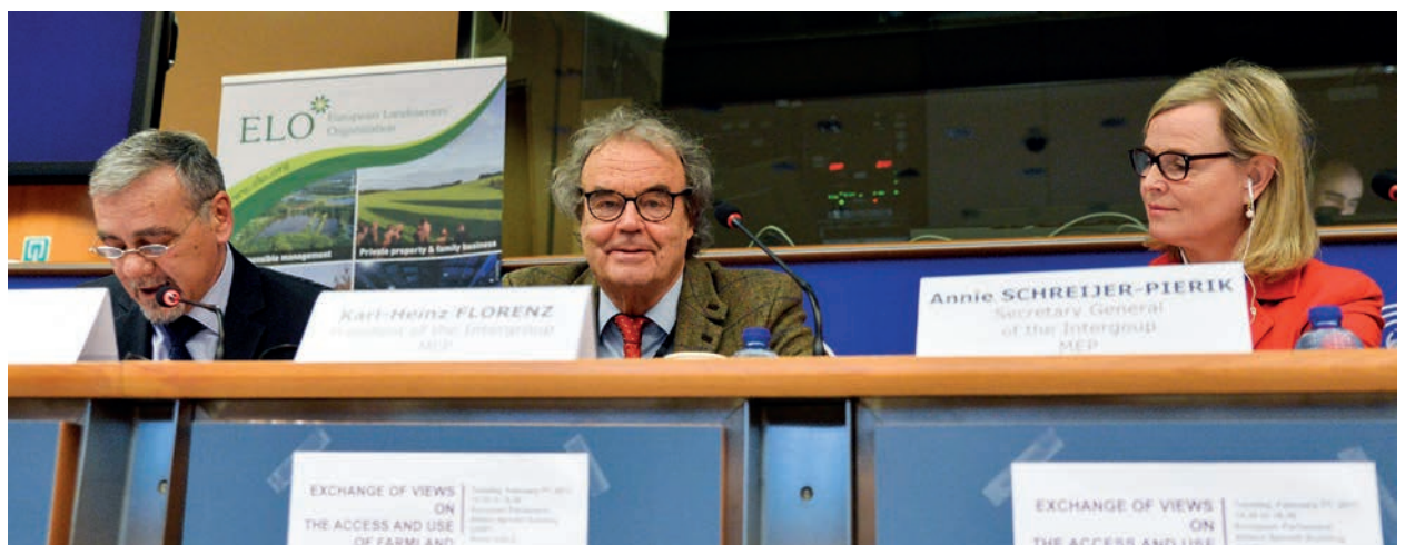
V. URUTCHEV, K.H. FLORENZ, A.SCHREIJER-PIERIK

The ELO will continue this vital debate and bring solutions as well as well-founded examples in order to ensure land access for the next generation of Europe's farmers, and to improve access to innovative tools for those already farming.