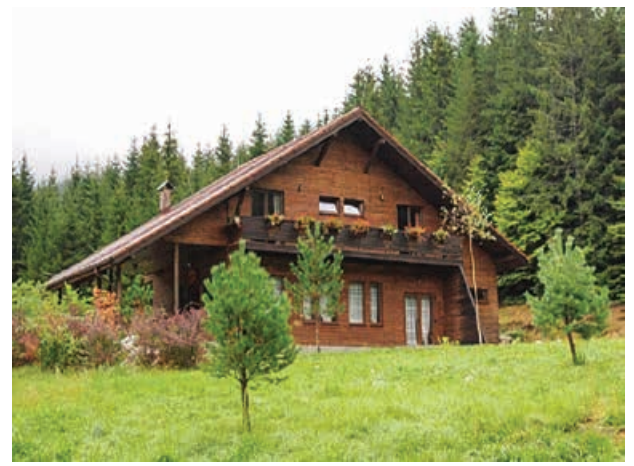
Silviculture Research Station, Ocolul Silvic, Râşnov, Râşnov Valley