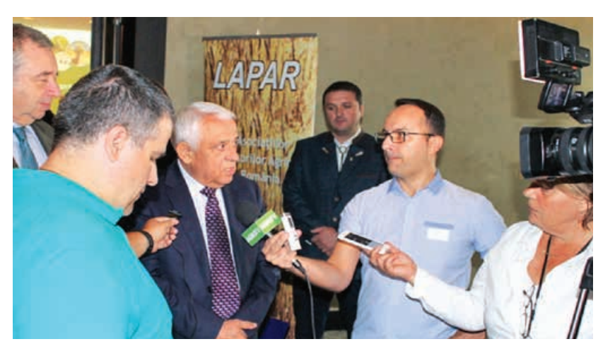
Minister DAEA addresses Romanian news reporters

For more information on or to attend one of our events please visit the site: www.wildlife-estates.eu or contact us by email: wildlife@elo.org