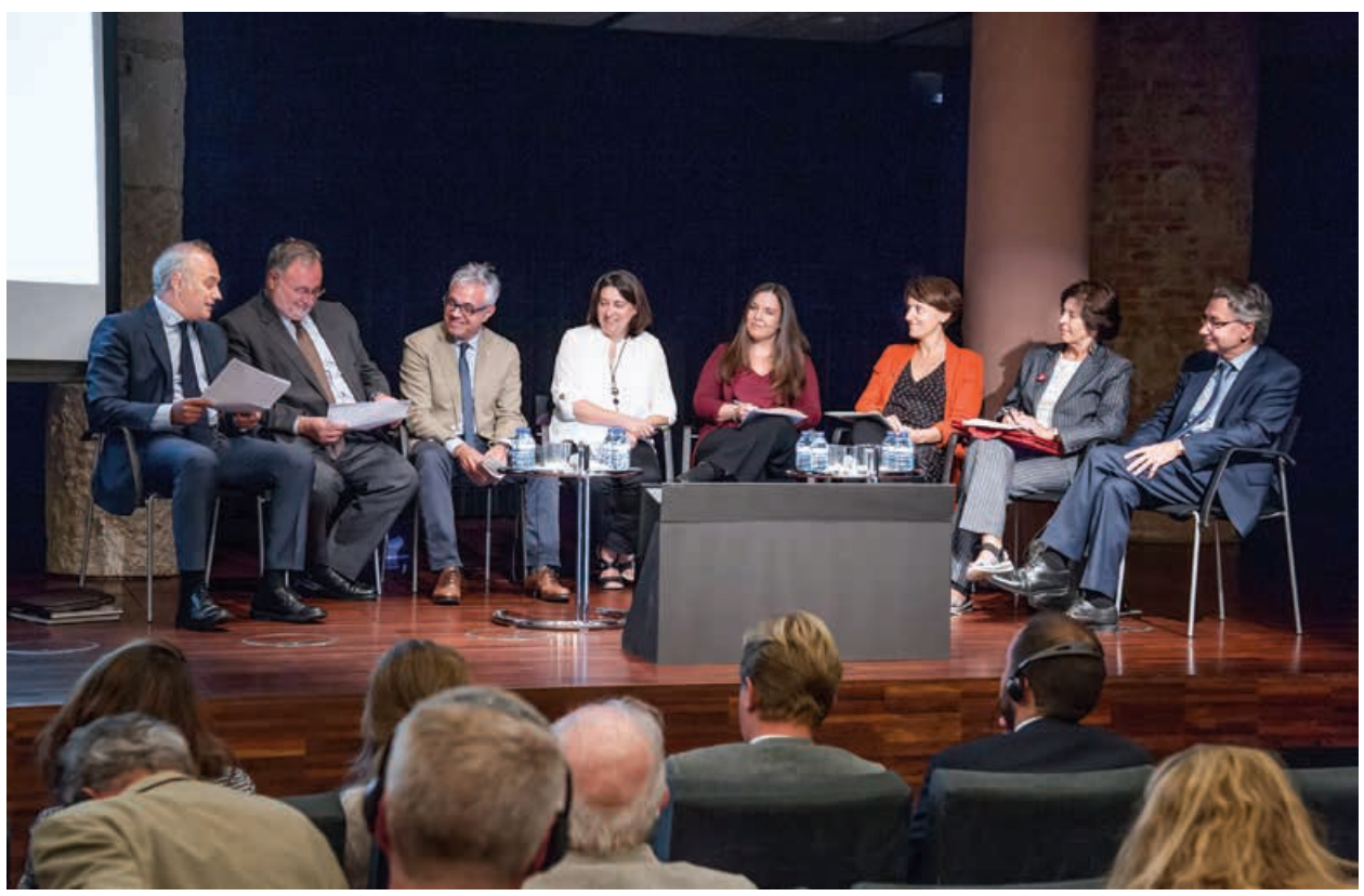
Conference '2018 European Year of Cultural Heritage: Promoting the role of historic houses owners in Catalonia and across Europe', La Pedrera. Barcelona