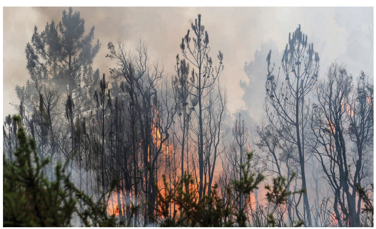
Forest fires in the South of Europe in 2017