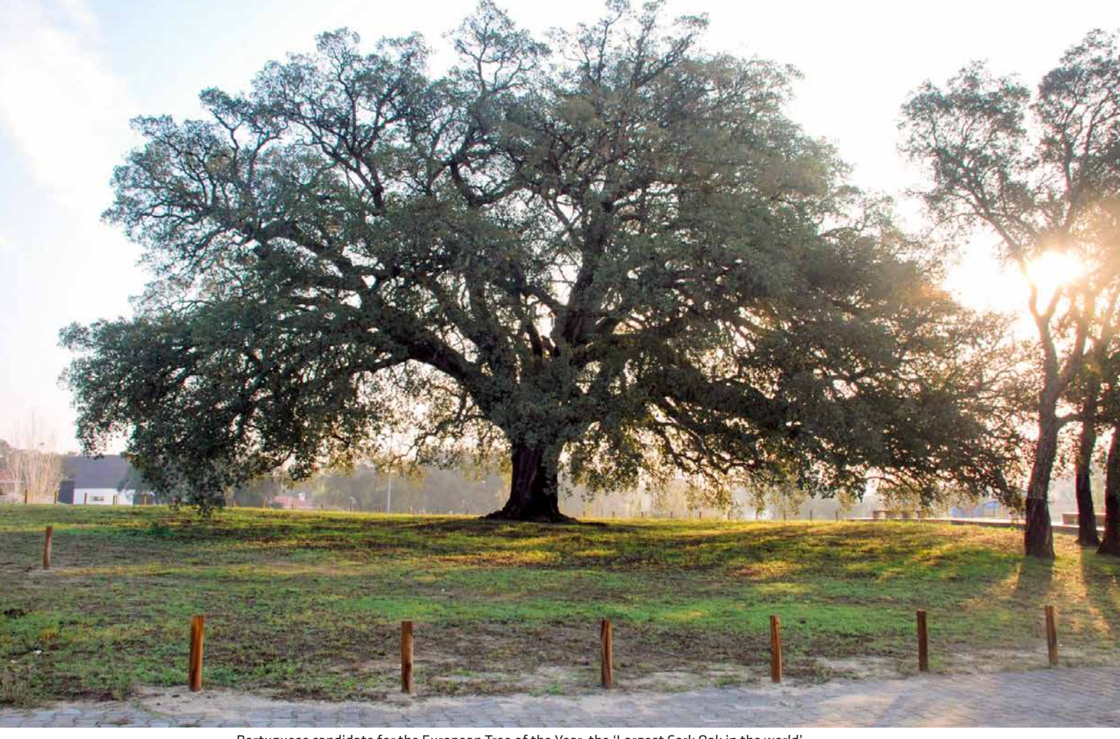
Portuguese candidate for the European Tree of the Year, the 'Largest Cork Oak in the world'