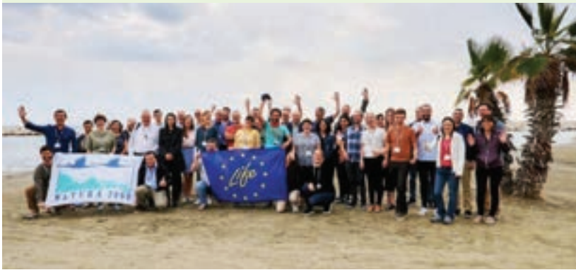
Meet our ambassadors, they are Private Land Conservation Superheroes!

At ENPLC, we believe individual action leads to a domino effect. We hope our ambassadors inspire you! For more details, their stories are available on the ENPLC website .