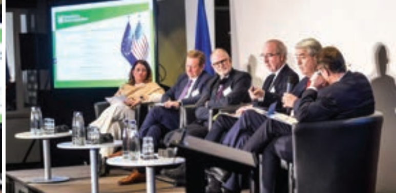
Session 2 participants

attention, not only on production, but also on the consumption side". The food industry has a key role to play in the transition since it influences what is sourced from farmers and offered to consumers.