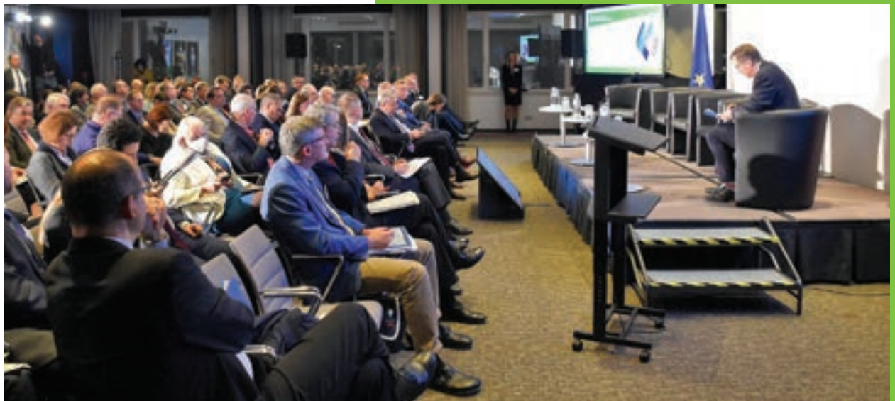
Participants to the event on the transatlantic partnership

The ELO urgently calls on all actors in this debate (rural stakeholders, NGOs and public authorities) to develop solutions together considering a positive balance between private interest and common good. This will enable all to take ownership of the objectives and generate the results that need to be achieved.