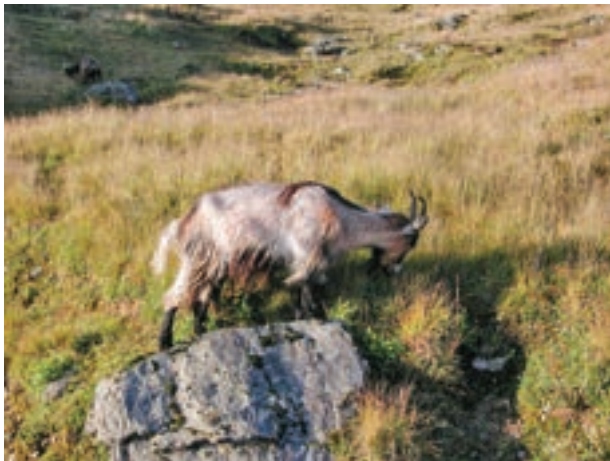
Transhumance goats in Western Norway.

The project strives to foster the practice of transhumance across Europe as a solution to some challenges related to land use and rural communities, such as rural depopulation, carbon footprint caused by the agricultural sector, and access to locally produced food.