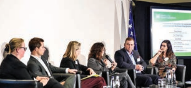
Session 1 participants