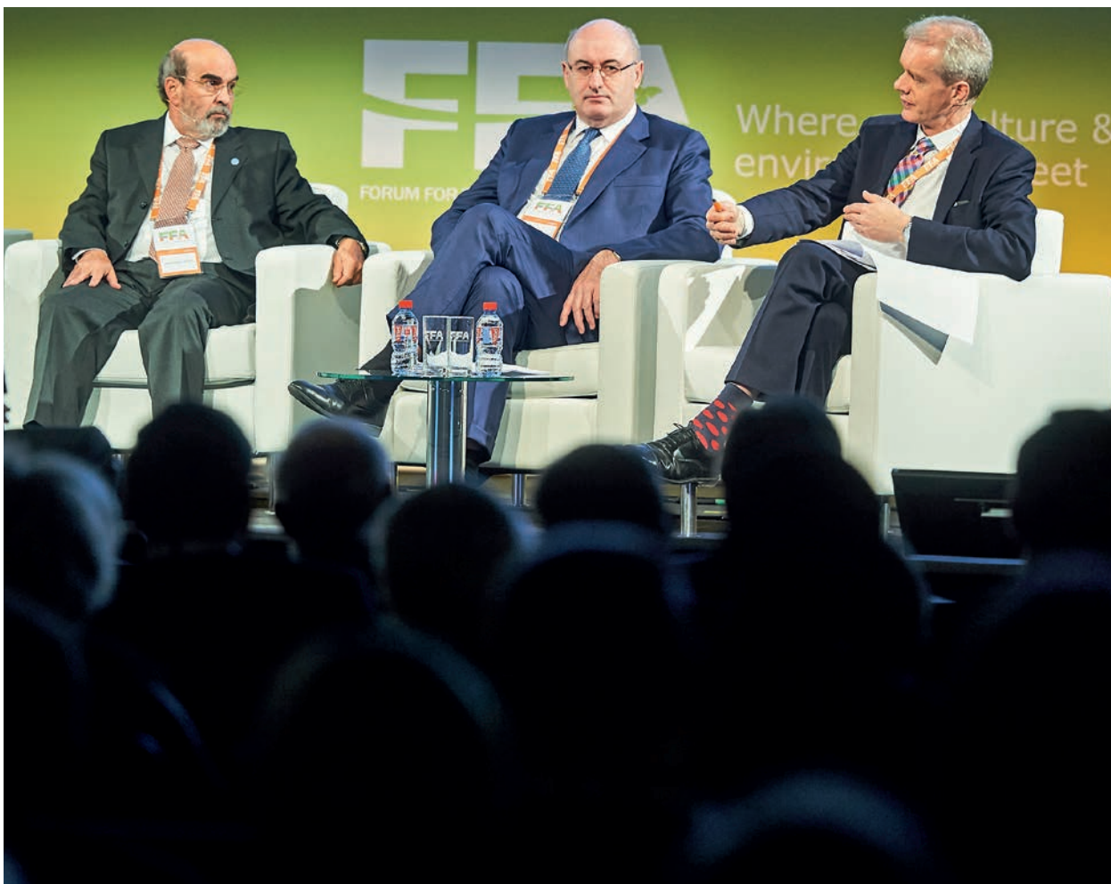
José GRAZIANO DA SILVA, Phil HOGAN, Stephen SACKUR