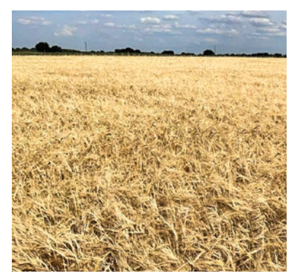
Malting barley in Manzanares (Ciudad Real) at the end of May 2021

But it is not all organic farming for conservation production: innovative techniques are also being used in the conventional cultivation of cereals and other extensive grains in Spain, such as conservation agriculture (combating erosion), sustainable agriculture (minimum inputs such as fertilisers and pesticides in the crop), integrated agriculture (intelligent control of pests,