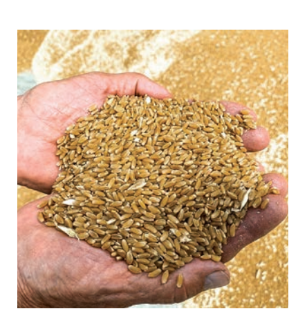
High-quality wheat produced in Andalusia in 2021

As we have already noted, Spain is a country that produces less grain than it needs, so it has to import it. Being a net importer means that our prices to farmers tend to be somewhat better than those of the major producing countries, as logistics and transport costs are considerable, and will be even more so in the future with the rise in oil prices and the increase in the cost of