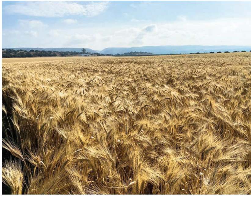
Durum wheat grown using conservation agriculture techniques in Hornachuelos (Córdoba)

As a good farmer friend from Zamora used to say: we have to be "optimistic" about the future of cereal and other extensive grain production in Spain. We have a harsh climate, very varied soils, normally low yields and many problems, none of them unsolvable. But we also have great quality in the grains we produce, we are leaders in organic farming, we have a country with the richest biodiversity in the EU, we know how to grow crops respecting the environment, the soil, water and air, nature, and we will continue to do so with hard work and enthusiasm in the cereal-growing areas of our great country, thinking of future generations and their well-being.