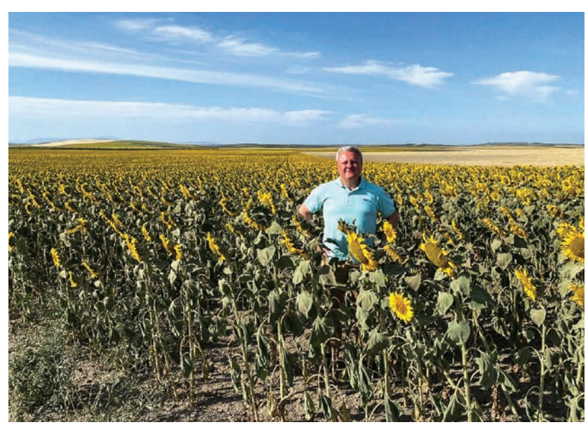
The author at the end of May 2021 in an organic sunflower crop in Paradas (Seville)

In Spain, cereal production in Castile-Leon, Castile-La Mancha, Andalusia and Aragon stands out, especially in rainfed areas, since in irrigable areas there is a rapid change in cultivation towards woody crops - olives, almonds and citrus fruits - which are more profitable than cereals.