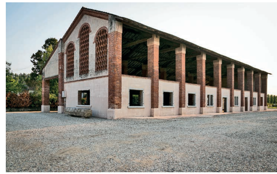
La Casinazza, agricultural building transformed in conference venue

to foster the entrepreneurial approach of the use of existing agricultural build-