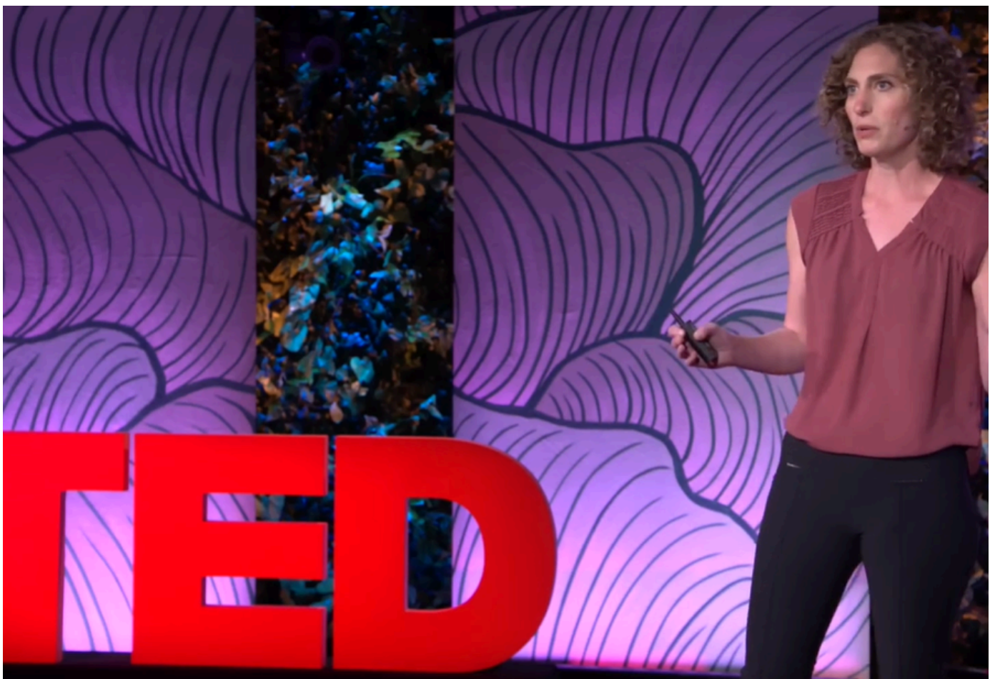
From the Video: "The Hidden Forces Behind Your Food Choices | Sarah Lake | TED" by TED

By diversifying production towards sustainable and nutritious foods - focusing on whole, plant-rich and minimally processed foods - we stand to make enormous strides towards improving public health, reducing future climate impacts, and supporting producer livelihoods.