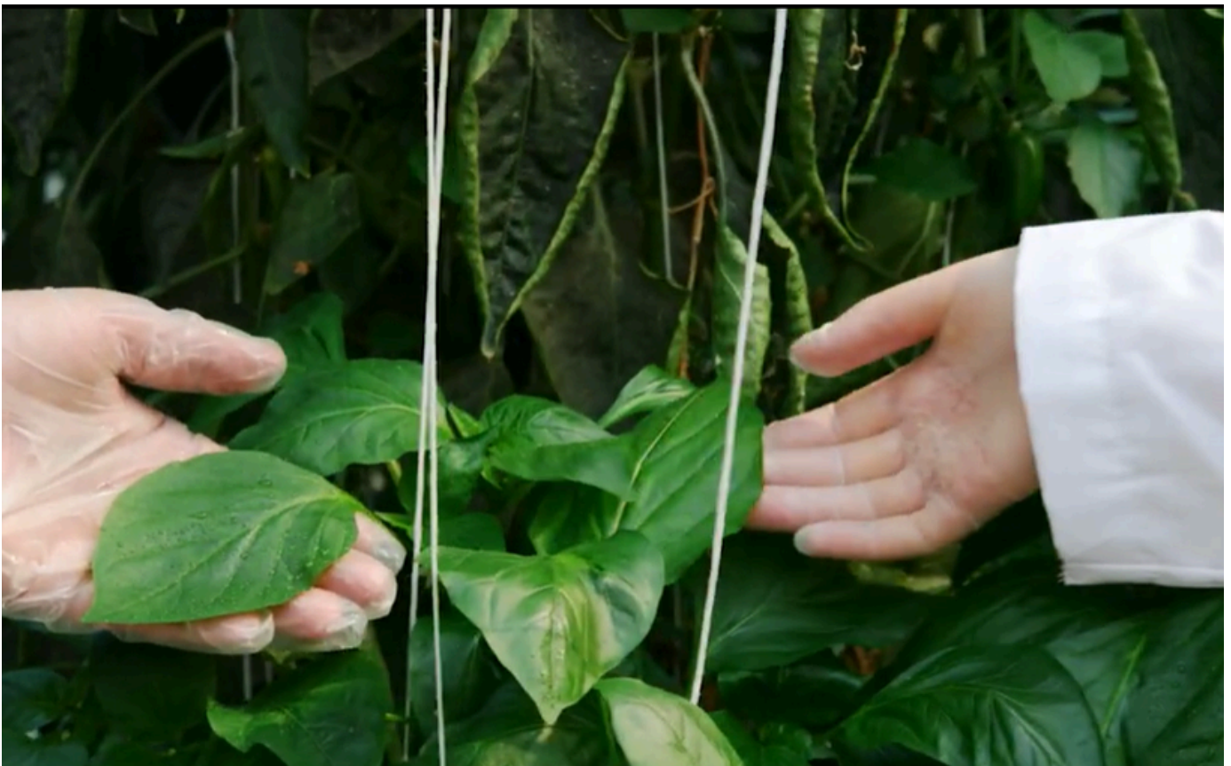
From the Video: “Biobest: Natural solutions to optimise global sustainable crop yields” by TBD Media Group

By introducing natural enemies – such as predatory mites that feed on harmful pests or parasitic wasps that suppress pest populations – IPM reduces dependence on chemical pesticides and offers an effective solution in high pesticide-resistance scenarios. As agriculture faces escalating chemical resistance, biodiversity loss, and regulatory pressure to reduce synthetic pesticide use, IPM has become increasingly essential. Its potential for adoption is especially strong in European horticulture, where consumer demand favors safer production systems. Beyond Europe, IPM represents a scalable, long-term solution capable of strengthening environmental health, farmer resilience, and overall sustainability.