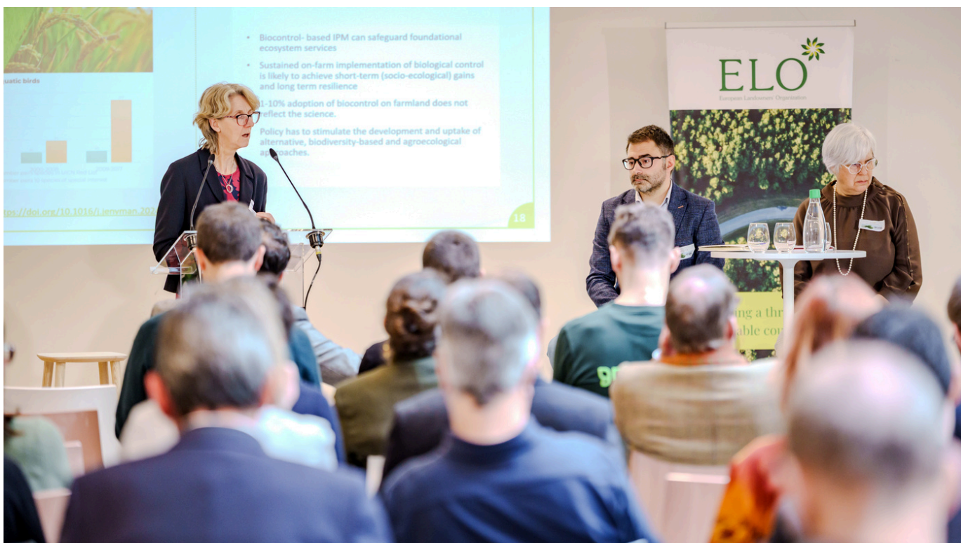
Photo from the event Innovators by Nature

What is most on my mind right now is the slow registration process for biocontrol in Europe. Approvals can take up to 10 years, compared with just 2 to 3 years in many other parts of the world, so we urgently need to speed things up if European farmers are to have real access to these solutions.